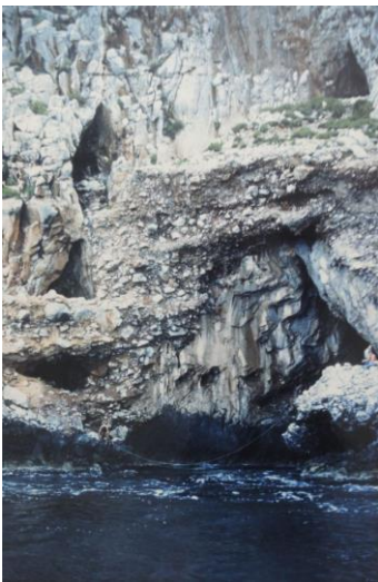
The Apidima cave complex, seen from the sea.